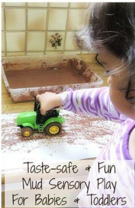
Taste-safe & Fun Mud Sensory Play For Babies & Toddlers