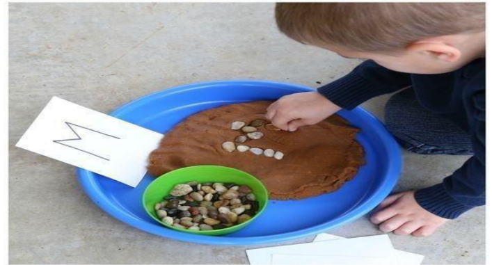
DIRT PLAY DOUGH Sensory Writing Tray