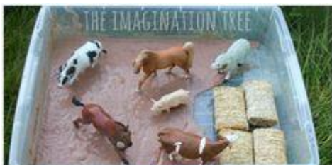
WASH THE MUDDY FARM ANIMALS! tasty sensory play for toddlers